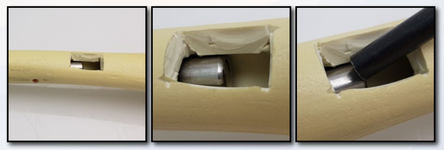
A window is cut in the bone on the end of the IM nail to allow a hammer and a punch to tap the IM nail out the opposite direction in which it was implanted.

Another alternative would be performing a small osteotomy on the distal end of where the IM nail is, and using a punch to force the nail out. But why waste all of that time, effort, and patient bone, when you can use a SHUKLA Nail v4 set and take the nail out in minutes?