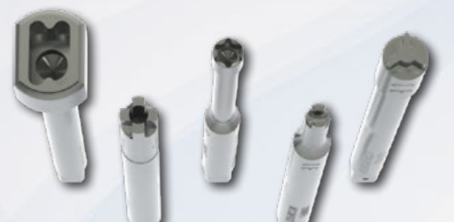
Small sample of how diverse spinal drivers can be.